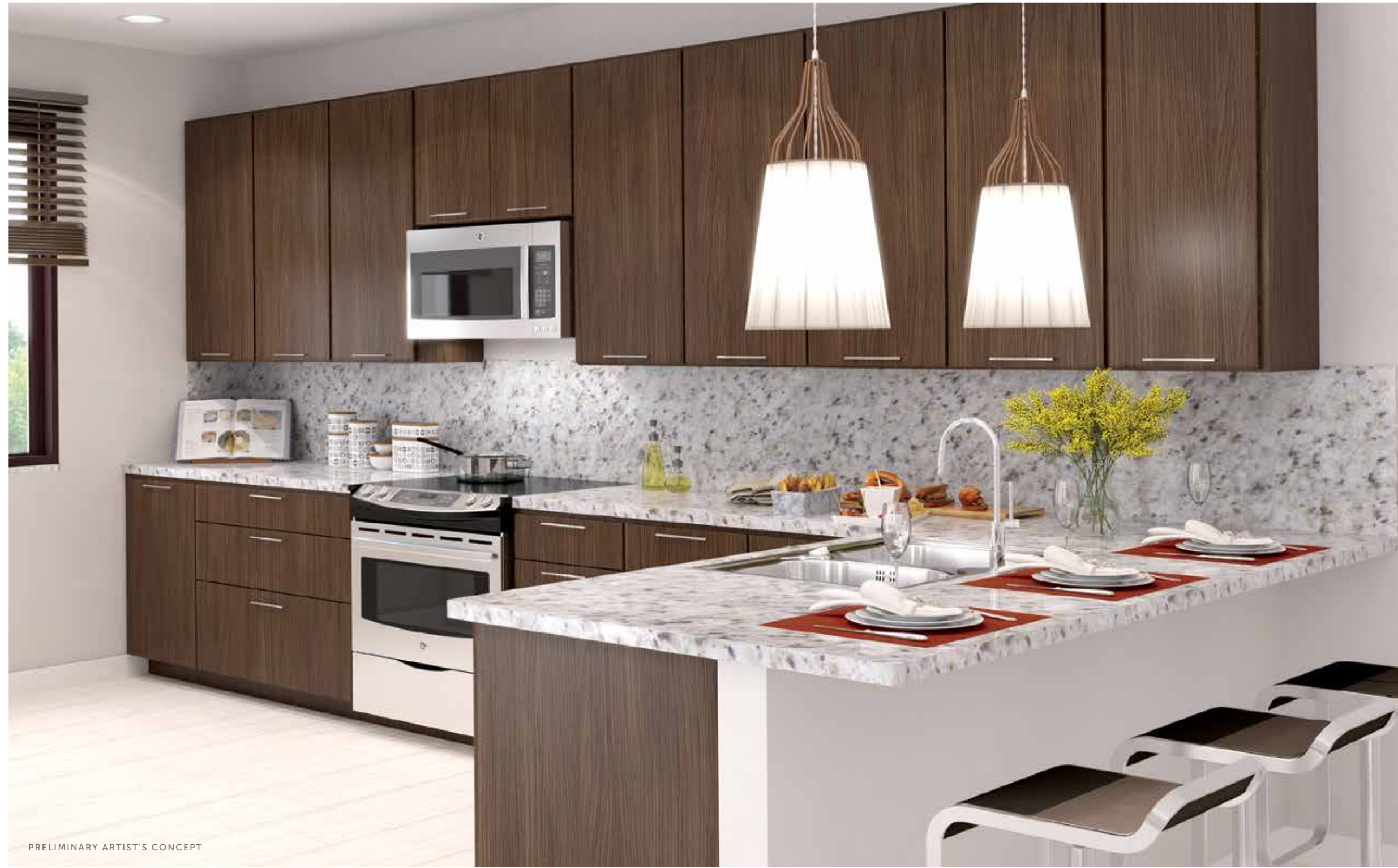
PRELIMINARY ARTIST'S CONCEPT