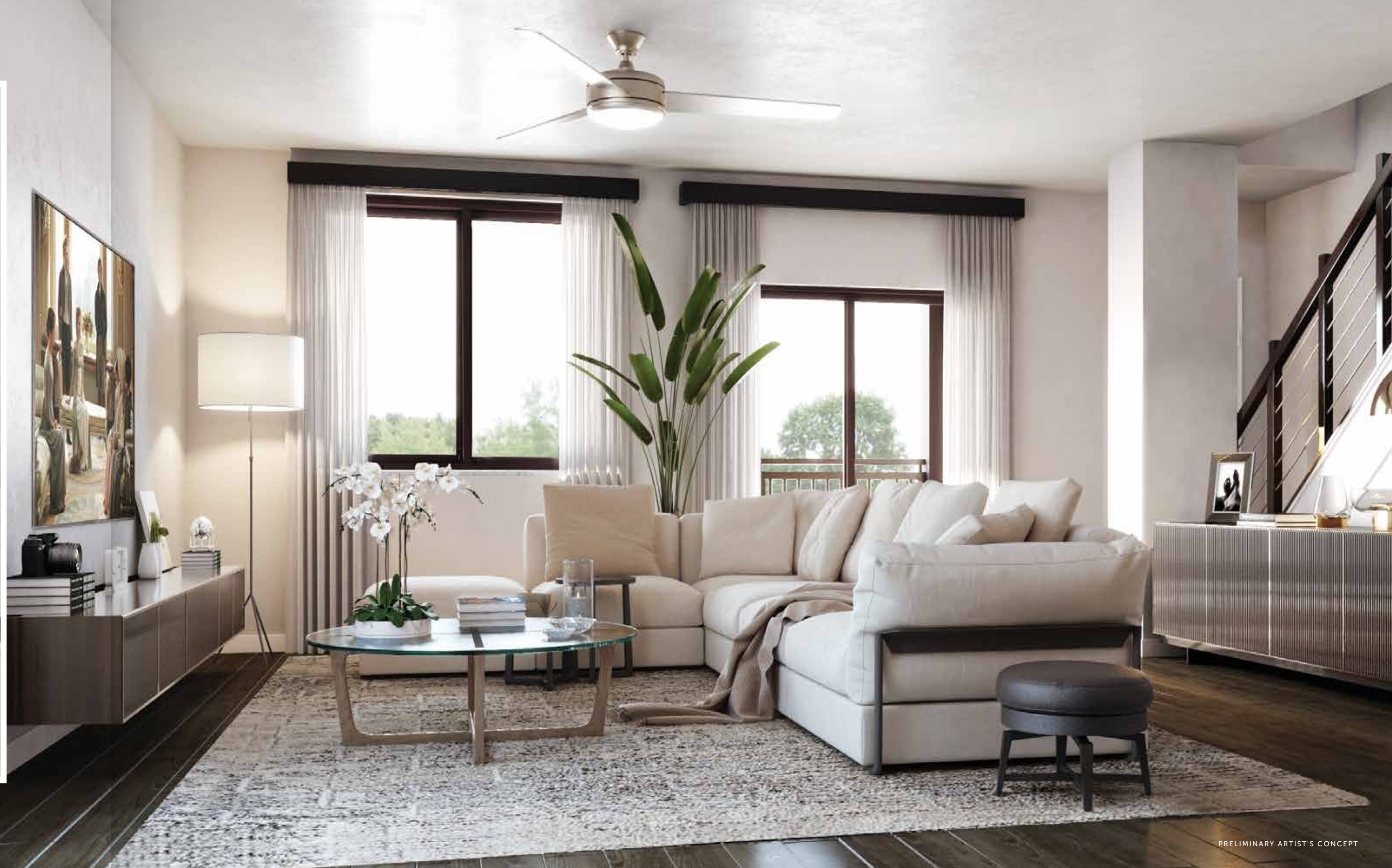
PRELIMINARY ARTIST'S CONCEPT